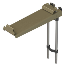
MAYO TRAY KIT FM840A127