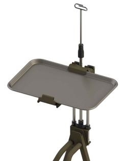
MAYO TRAY FM840A116

To Disinfect: Treat all surfaces with disinfectant following the disinfectant manufacturer's guidelines for application method and contact time.